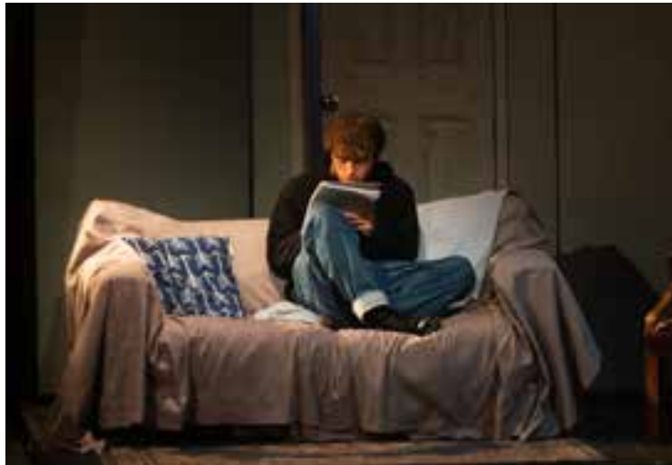
The Son, ADC Theatre

Astrid Improltergeist Great Mother - Iya Ayaba The Nature of a Curve Smorgasbord The Old Bailey Alumni Network A Comprehensive Understanding The Man Who Wouldn't be Murdered The Proposal and The Bear HATCH A Small Family Business