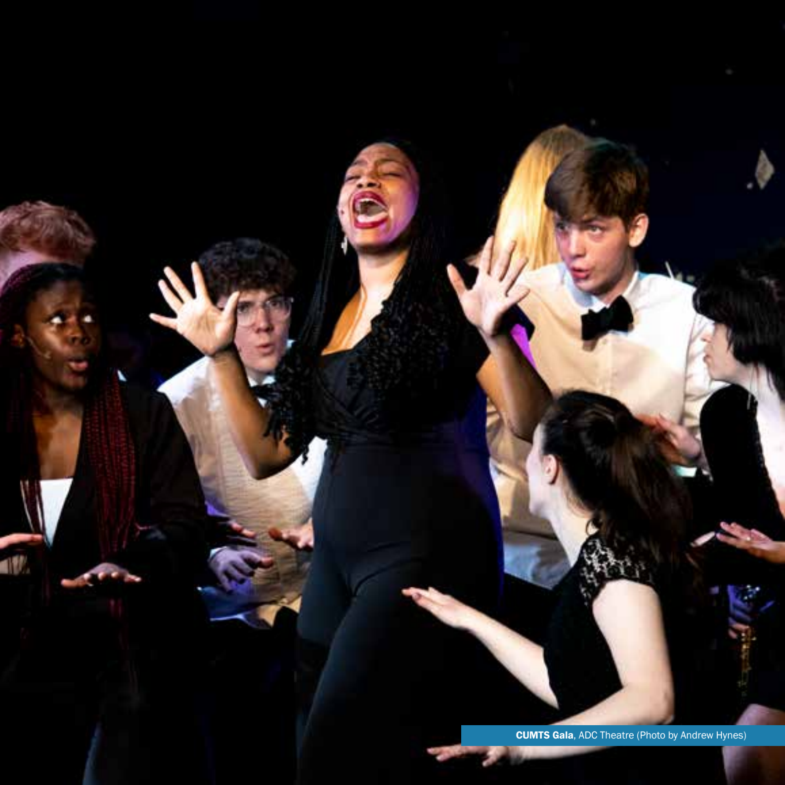
CUMTS Gala, ADC Theatre