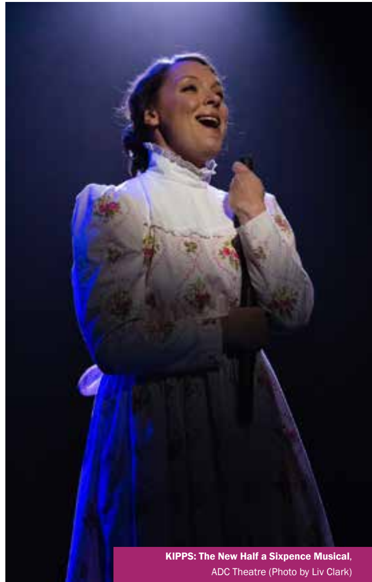
KIPPS: The New Half a Sixpence Musical, ADC Theatre