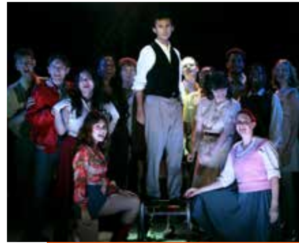
Company, ADC Theatre

When factoring in the theatre's assets, liabilities and revaluations in its internal investments, the bottom line of the balance sheet has improved this year, sitting at an extremely modest albeit still positive value. Discussions have begun with the University's Finance Division regarding the replenishment of the theatre's otherwise fragile and depleted reserves, and the Executive Committee will continue to discuss the possibility of long-term fundraising to support the financial sustainability of the ADC Theatre's activity.