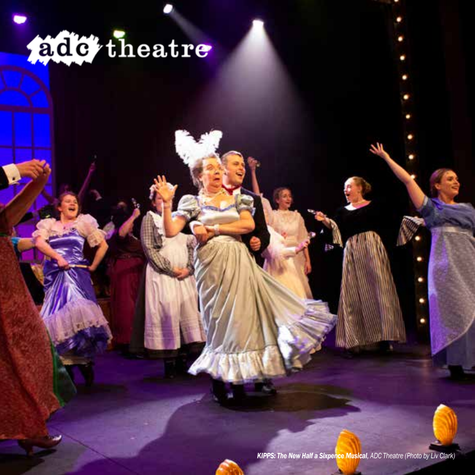
KIPPS: The New Half a Sixpence Musical, ADC Theatre